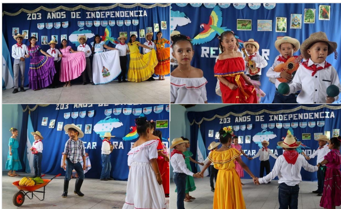
Civic Ceremony – Primary School