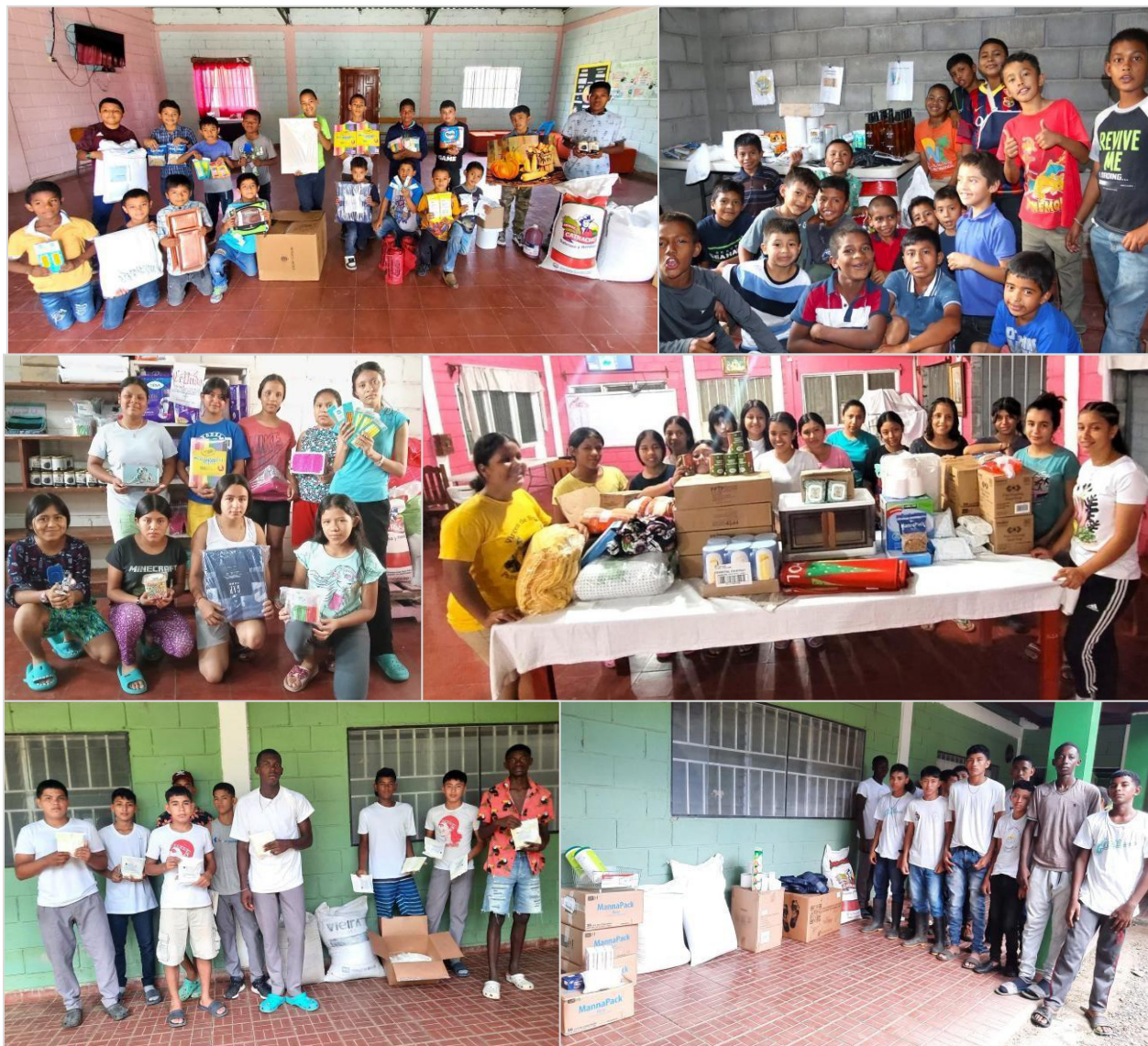
Households Supported by CEPUDO's Donation:

Cepudo CAPACITACIÓN, EDUCACIÓN, PRODUCCIÓN, UNIFICACIÓN, DESARROLLO, ORGANIZACIÓN Caminando con Dios