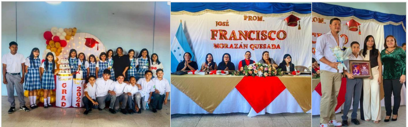
Sixth Grade – Santa Ana School 2025

Additionally, we celebrated the graduation of Sixth Grade students from Santa Ana School and Ninth Grade students from San Antonio de Padua Institute, Salamá.