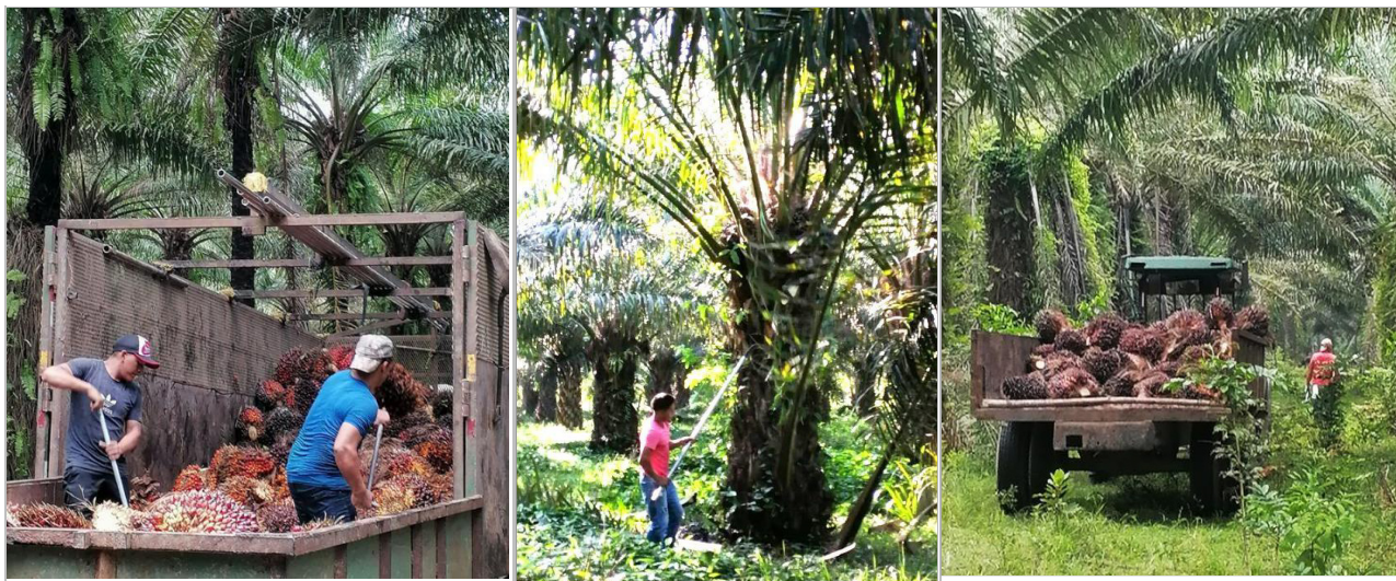
Management, harvesting, and pruning at APUFRAM African Palm Plantations, Colón.

We continue our efforts to achieve institutional sustainability, and in 2025 we successfully carried out the harvest at the African Palm Plantations. At the same time, we improved our livestock projects in the Colón Department through effective management.