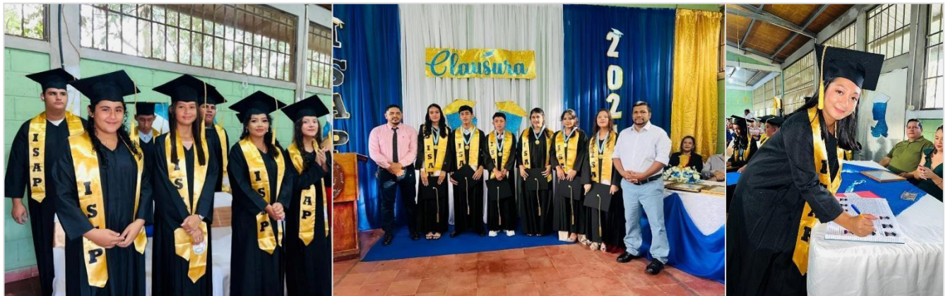
Ninth Grade – San Antonio de Padua Institute, Salamá 2025