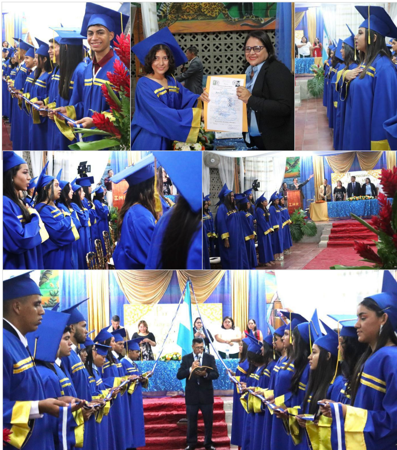
Instituto Maximiliano Kolbe 2025 – II BCH & III BTPI

APUFRAM OPCIÓN PARA EL DESARROLLO HUMANO