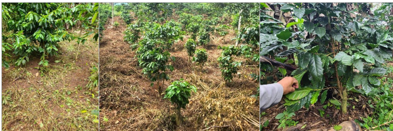
Cleaning and pruning activities carried out on the farm during the 2025

This organic coffee comes straight from the highlands of San José, and its production is dedicated to meeting the needs of APUFRAM households and other projects, as well as supporting our social assistance programs through generated income.