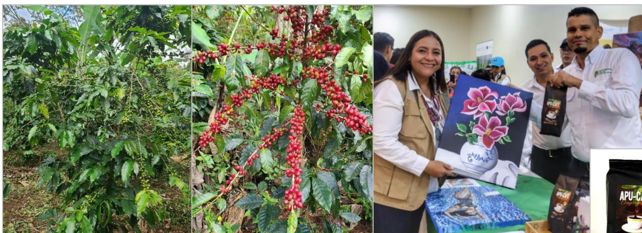
APU-CAFÉ production, harvest, and presentation, 2025.