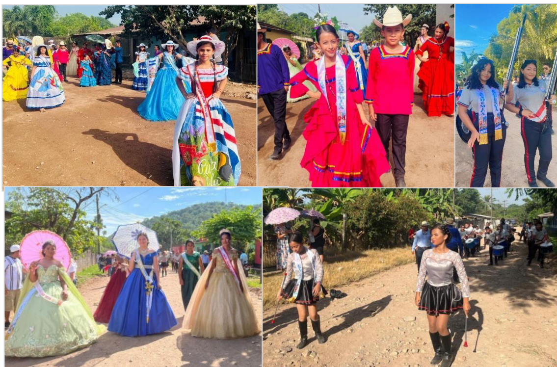
Patriotic Parades – Secondary Schools