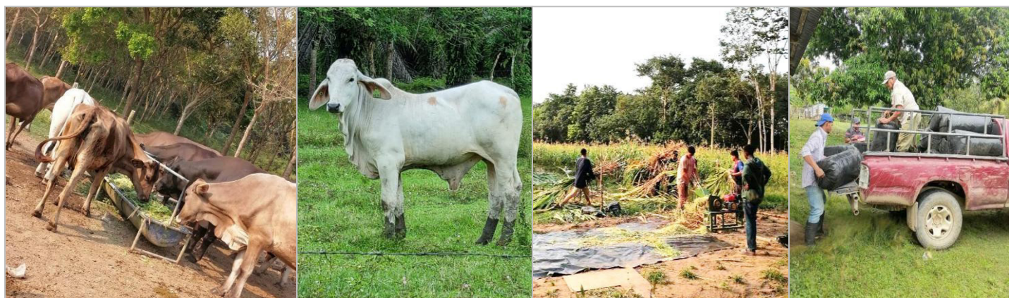
Management, transport of breeding stock, and silage production at Livestock Ranches, Colón.